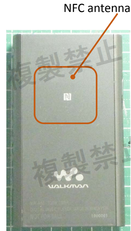
The back side of the product