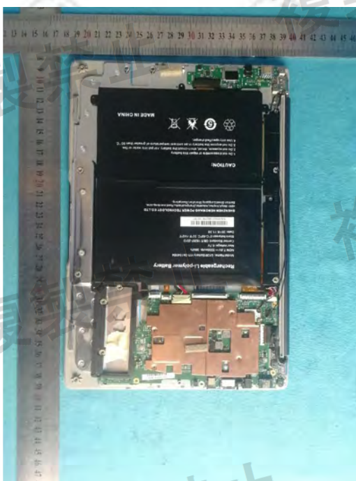
View of product-11