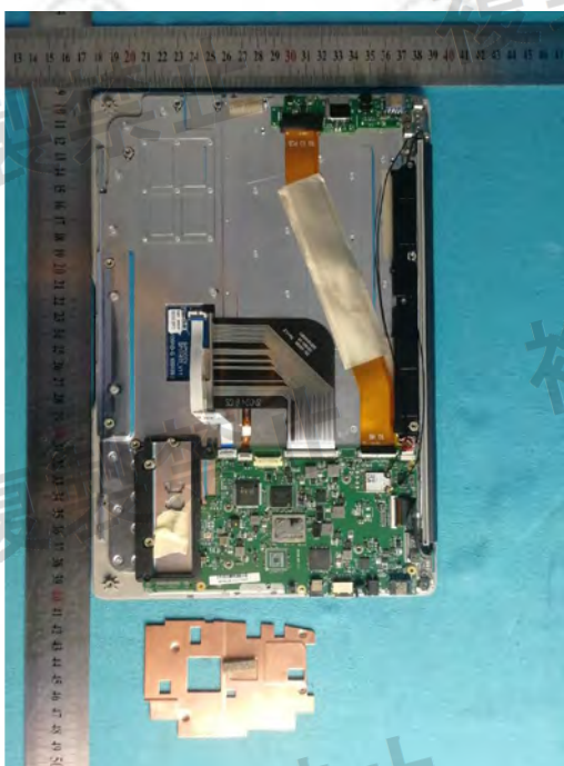
View of product-15