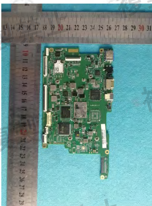
View of product-17