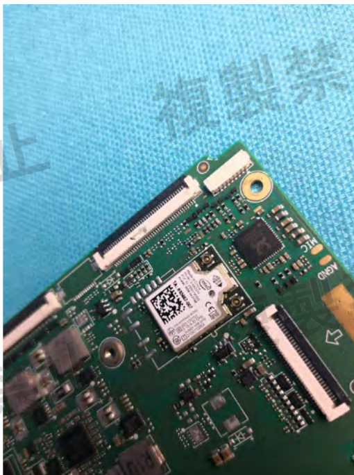
View of product-20