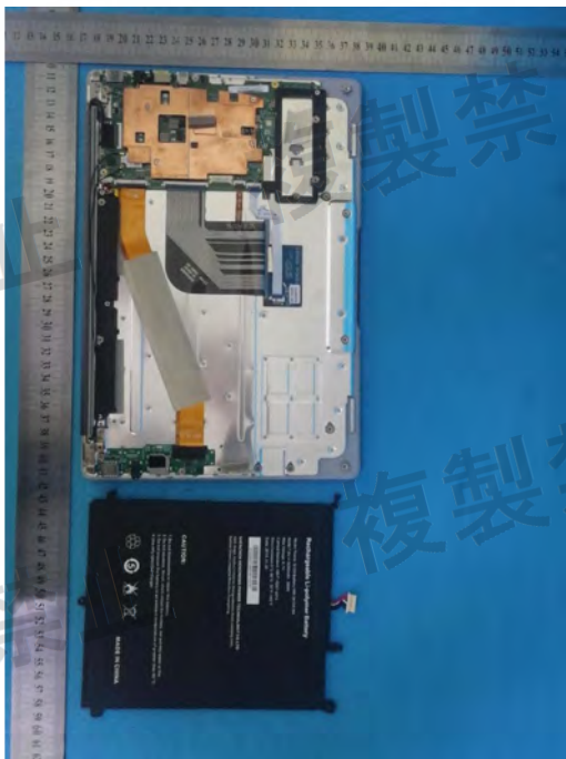
View of product-12