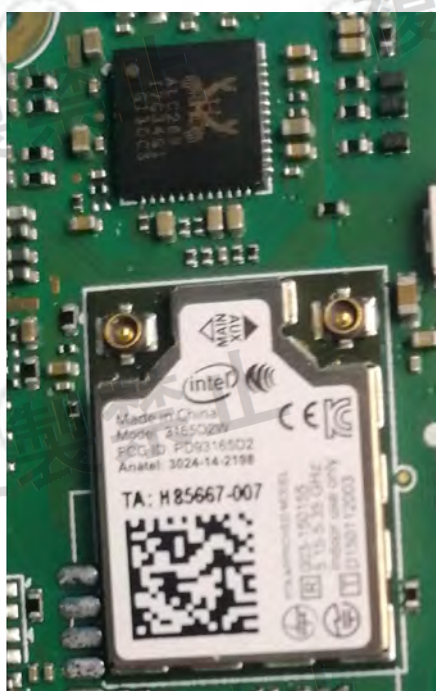
View of product-19