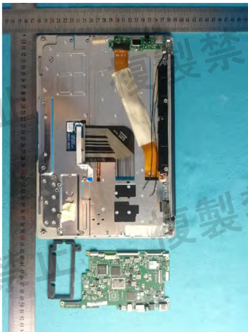
View of product-16