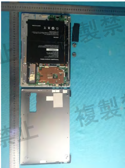
View of product-10