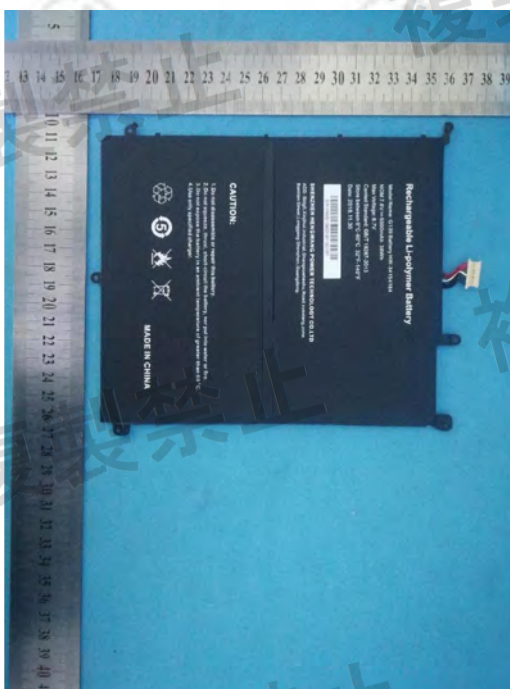
View of product-13