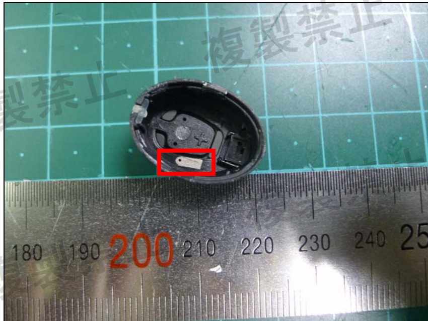
Antenna view of EUT