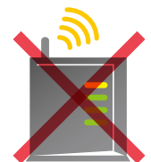
[Wireless LAN router]