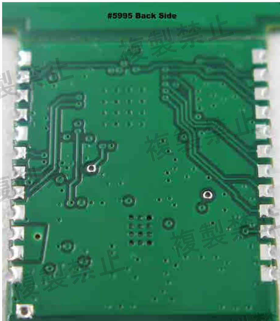
Fig. 2 Back View