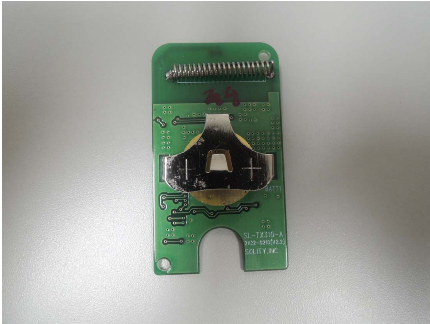
Main Board Rear