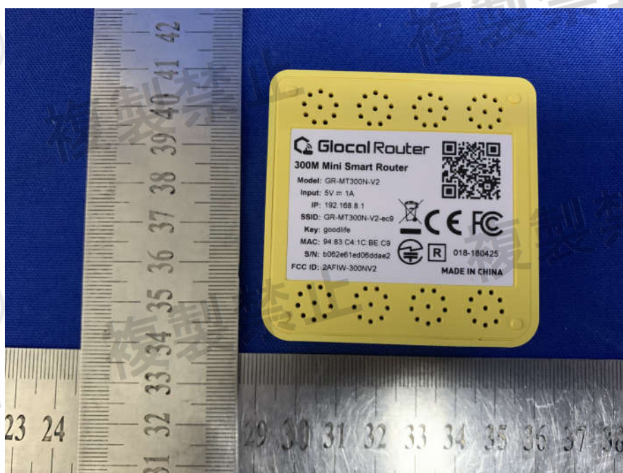
View of product-6