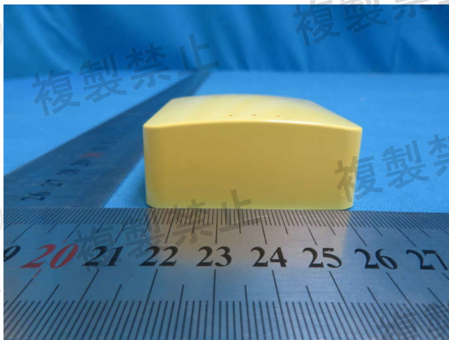
View of product-4