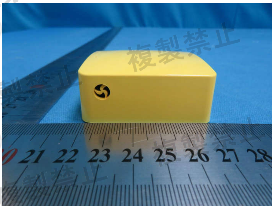
View of product-5