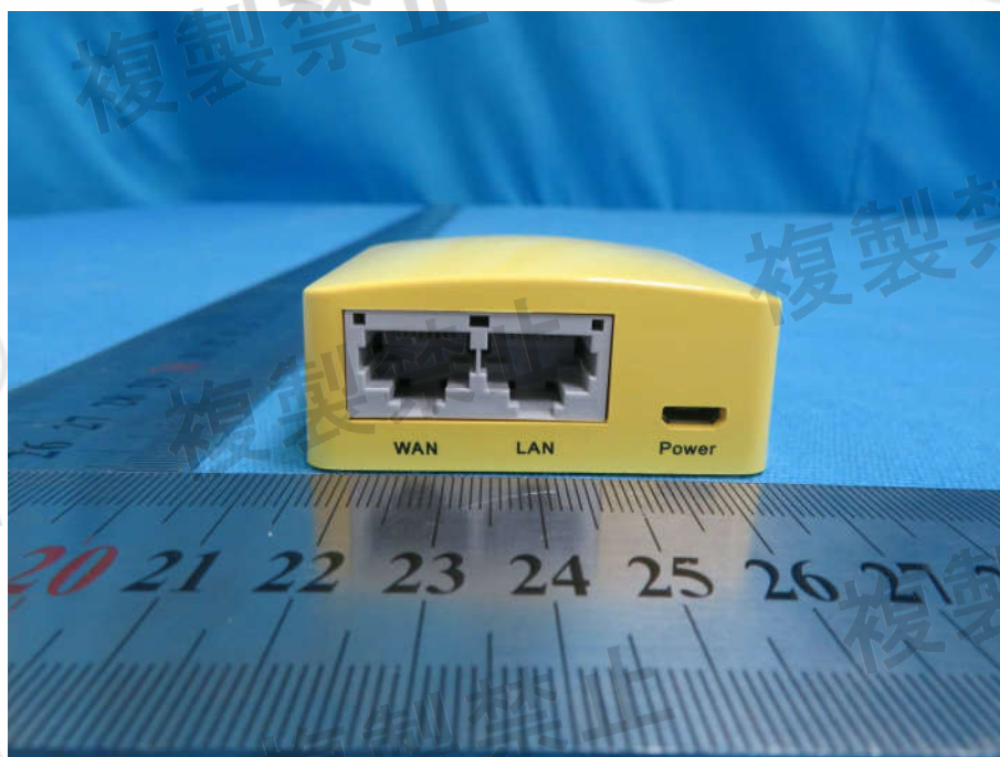
View of product-2