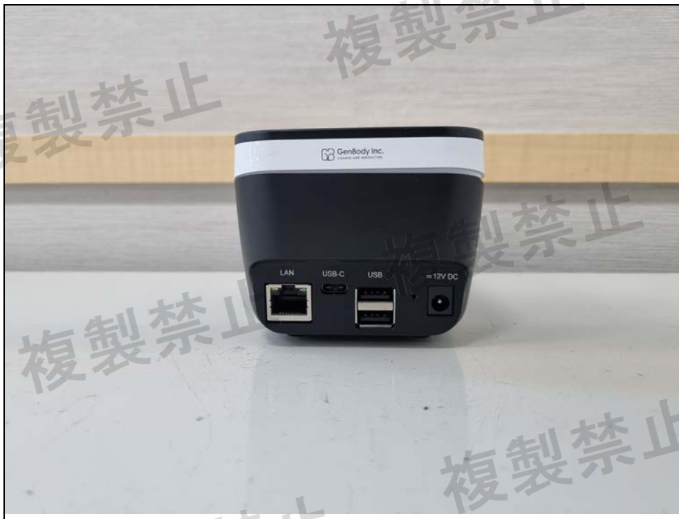
Bottom view of EUT