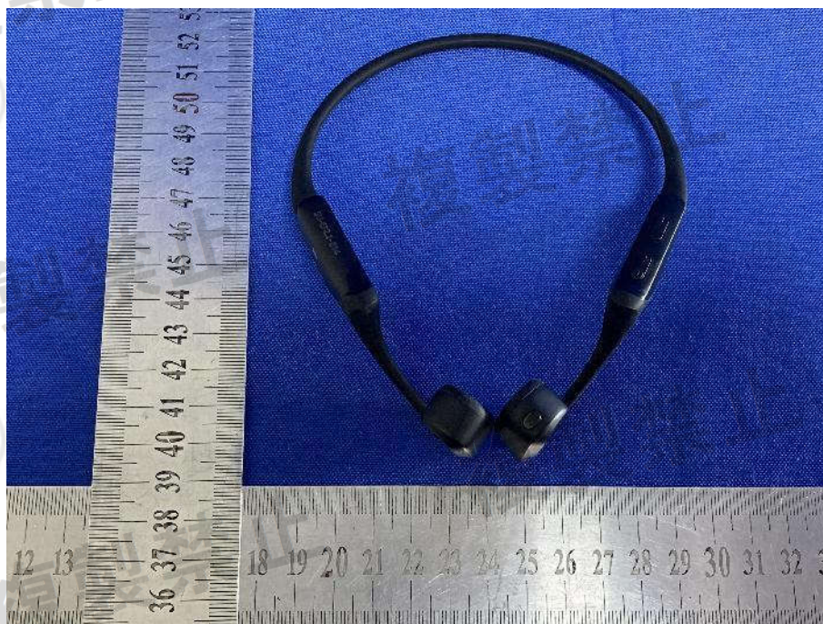
View of Product-7