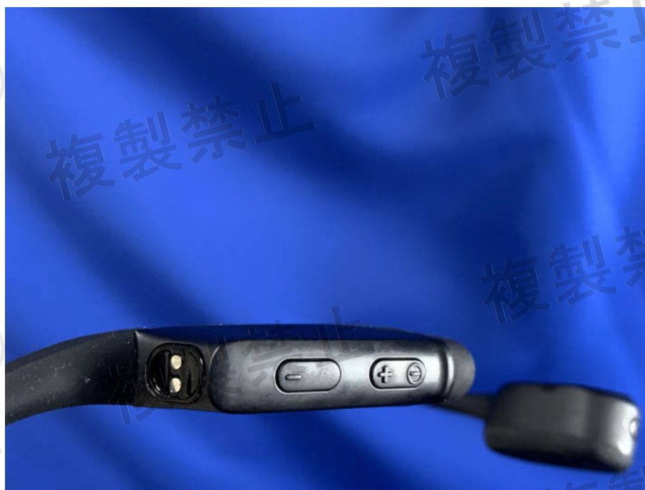
View of Product-10