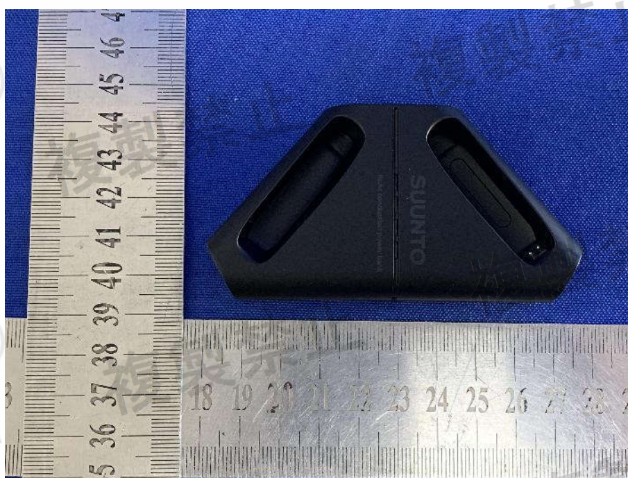
View of Product-8