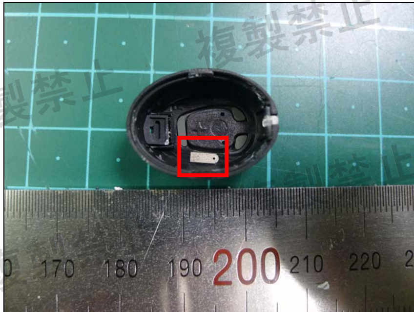
Antenna view of EUT