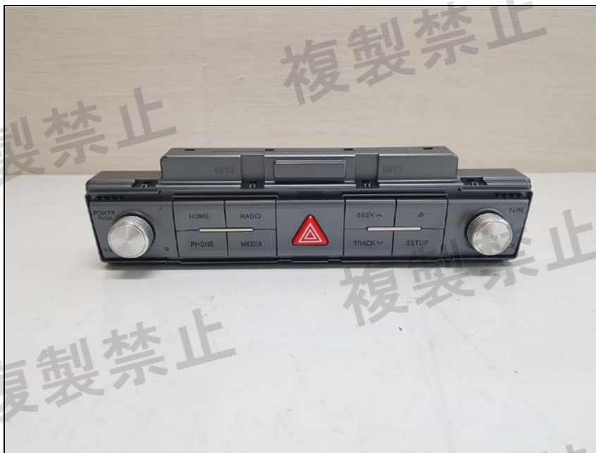
Rear view of EUT