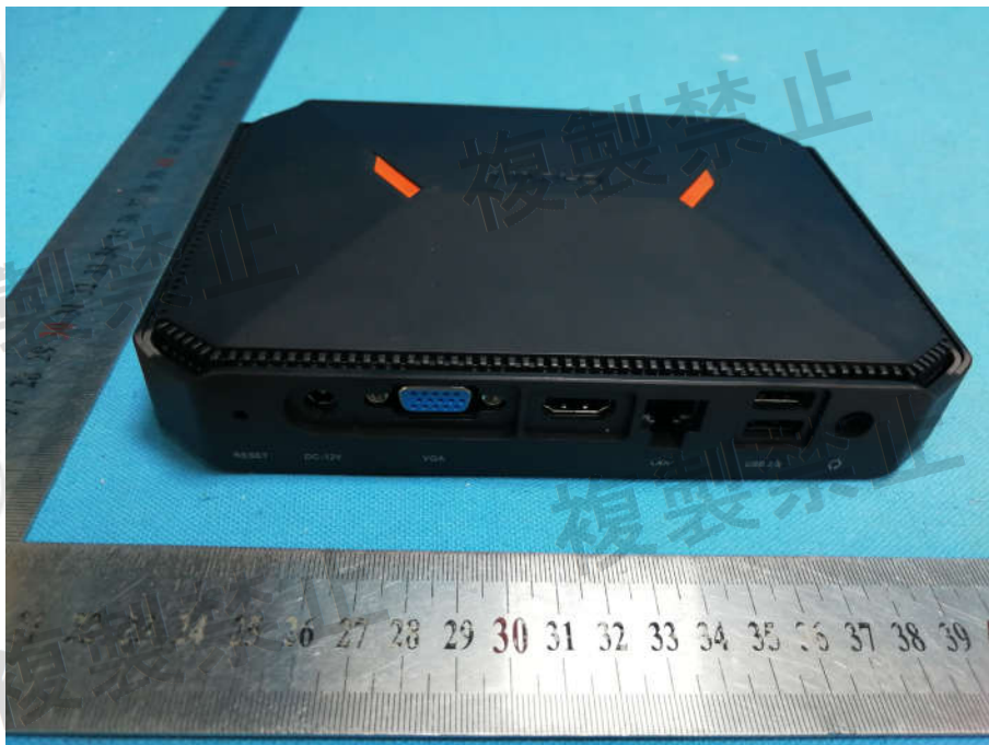
View of Product-5