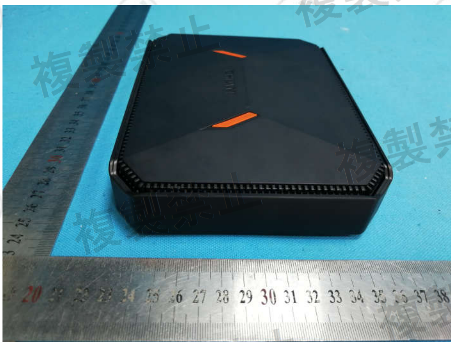
View of Product-6