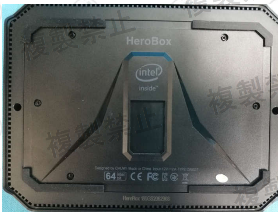
View of Product-8