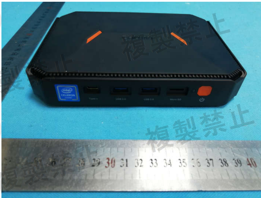
View of Product-3