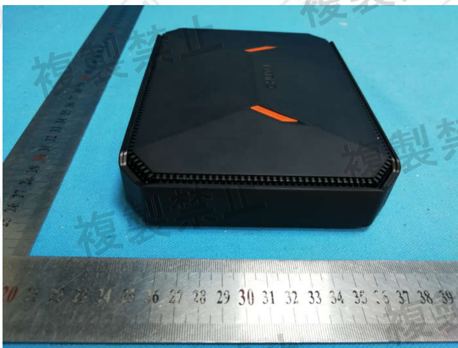
View of Product-4