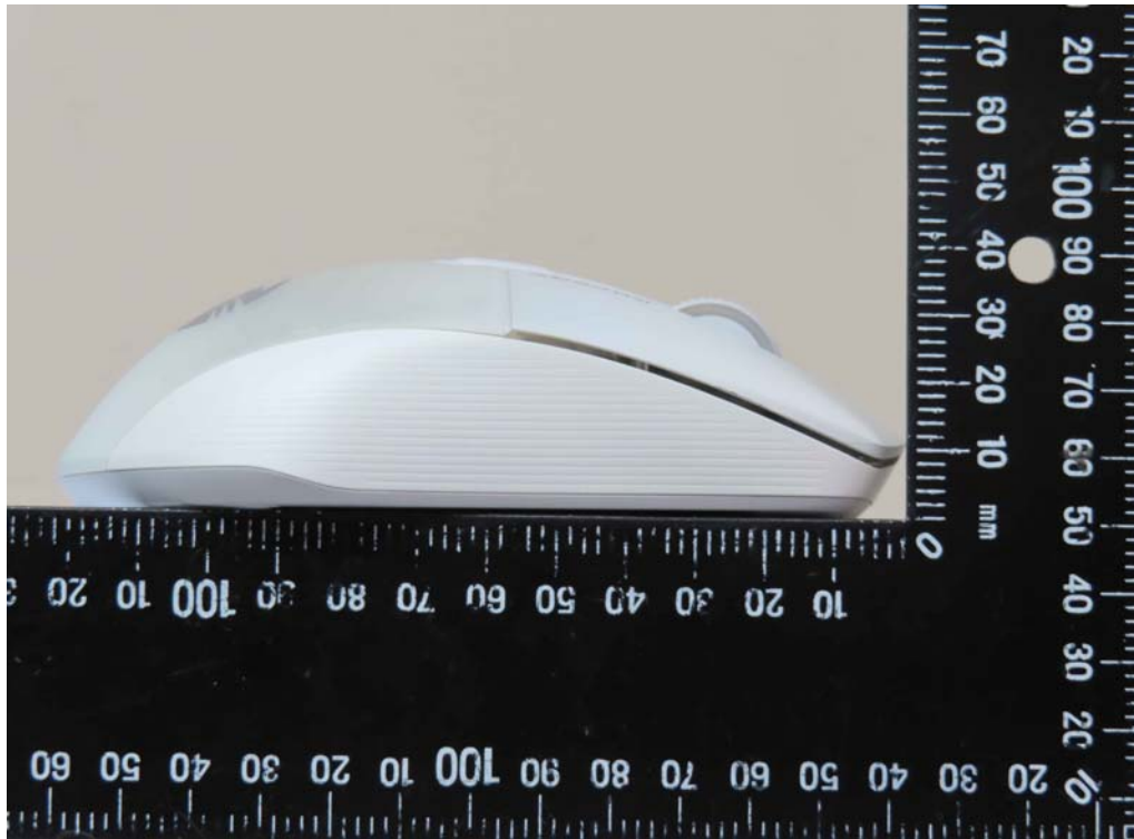
Side View of EUT – 5

Unless otherwise stated the results shown in this test report refer only to the sample(s) tested and such sample(s) are retained for 90 days only.